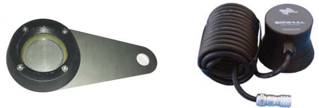
Stern Drive Adaptor – Bolt-on adaptor to protect hard-to-reach equipment.